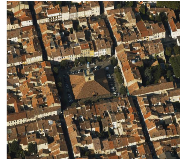
Square 'Philippe VI de Valois', covered-market 14 th c.