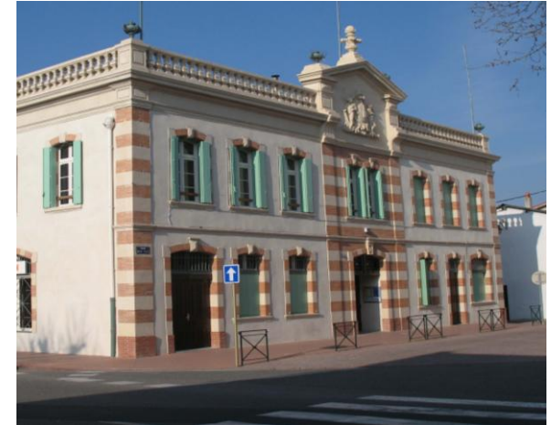
Cultural Centre Get

Culturel Get : This building, which houses a cinema, a multimedia library and a cultural centre, was the famous mint liquor factory of Peppermint - Get 27 until 1988. On top of the façade, a triangular pediment proudly bears the Get family coat of arms, exactly the one which adorns Get bottles everywhere. Warehouses and the distillery can be found at the back and at the sides the building.